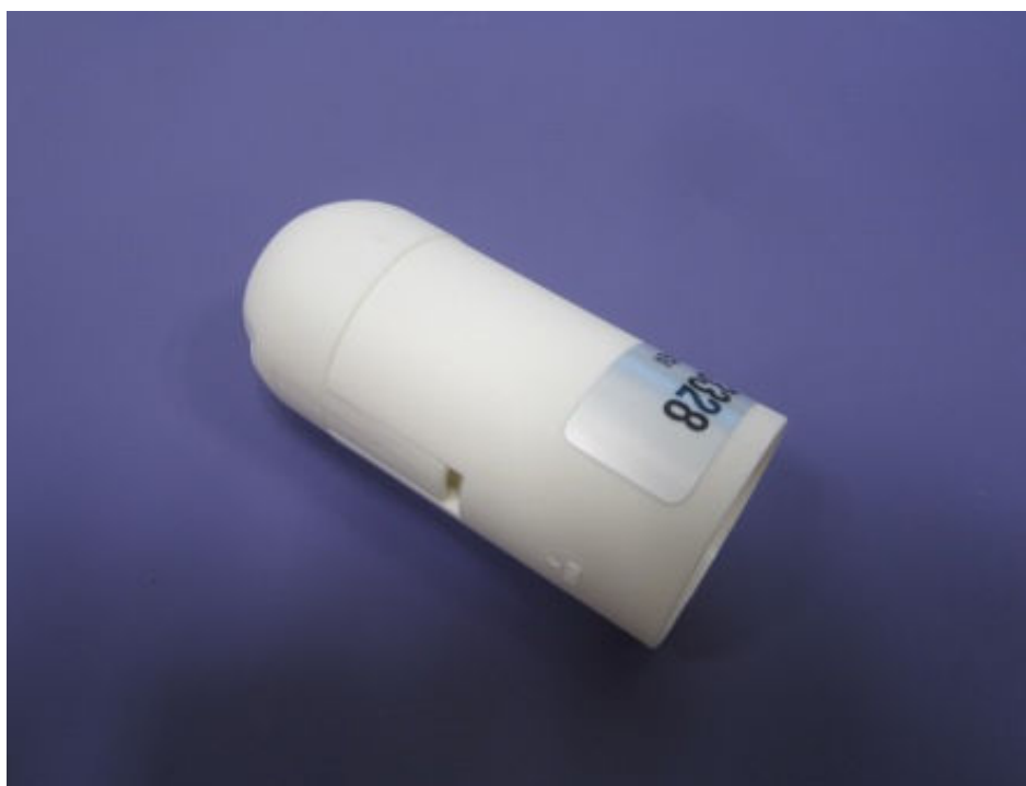
Type 1101 (art. 11011 or 11012)